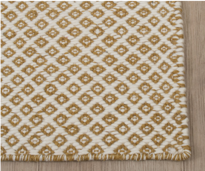
Honey / Ivory