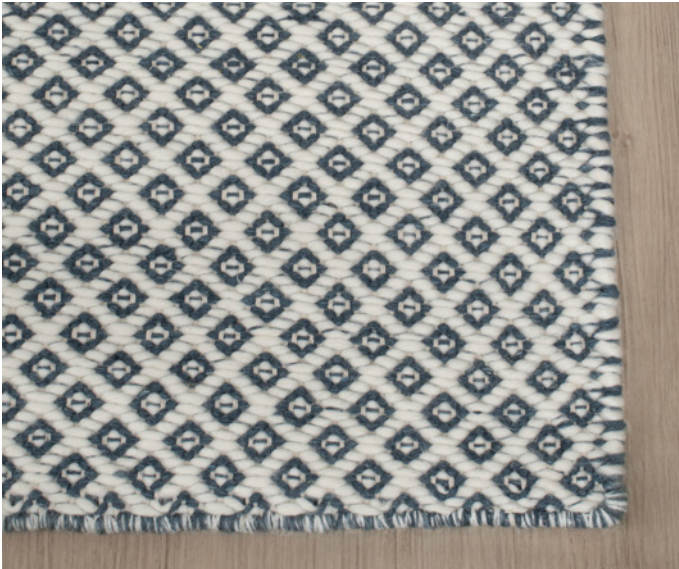
Blue / Ivory