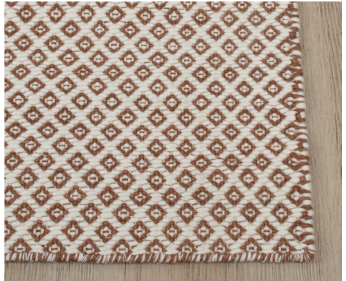
Rust / Ivory