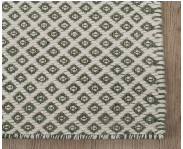
Green / Ivory