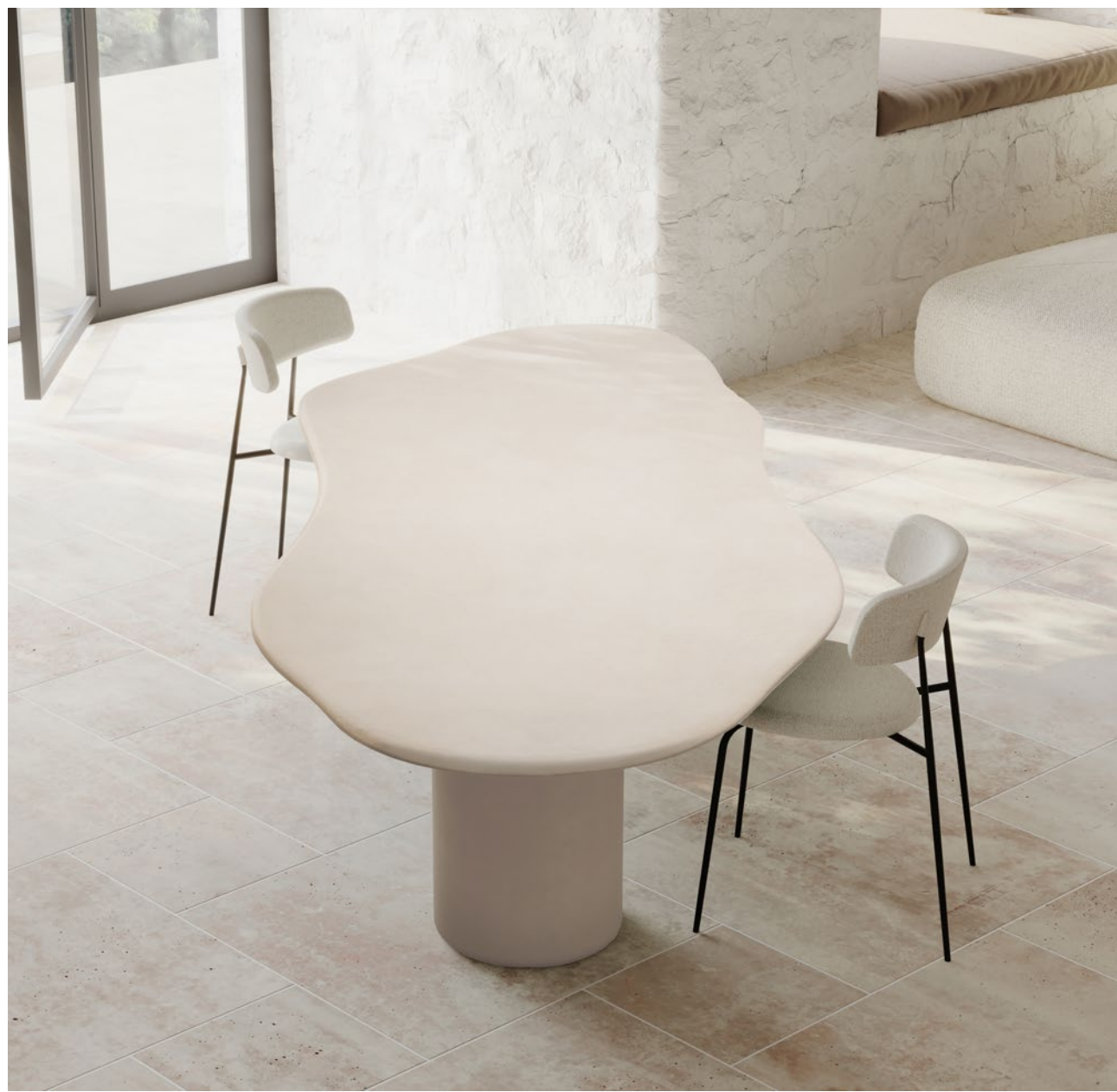
LAINI DINING TABLE